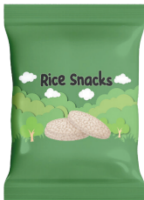
Mini rice wheels