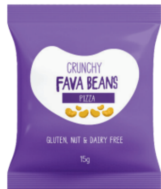
Roasted fava beans

For more ideas and recipes, visit www.swapit.net.au/recipes